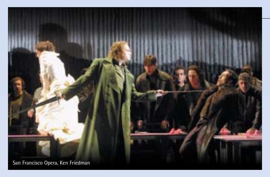
Sung in English with Surtitles; Corporate Guarantor: ExxonMobil